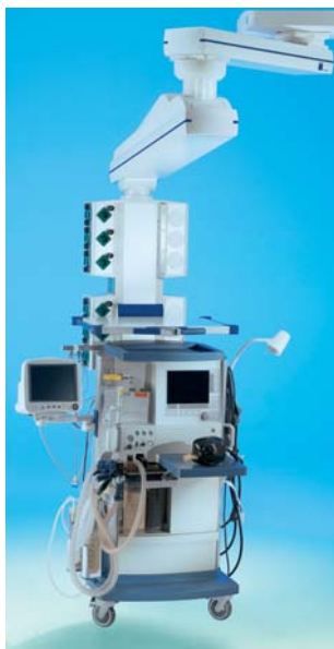
Motor-adjustable height with 180 kg payload

TRUMPF ceiling pendants come in three weight categories and enable tailor-made solution systems for anaesthesia, minimally-invasive surgery, endoscopy, intensive care, neo-natal care and emergency medicine.