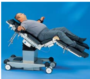
TITAN – up to 450 kg patient weight

Flexible, mobile and strong – all at a reasonable price. Easy to move, thanks to motorised drive and brake support systems. A special extra-low version is available to allow operating from a seated position.