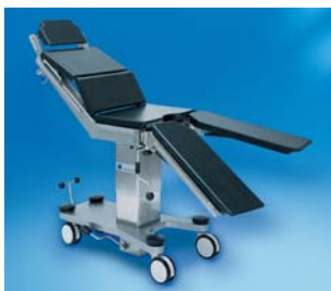
MERKUR – easy handling

Motorised tabletop element function supported by columns and pneumatic springs for easy handling. Mechanical length adjustment and optional seat element extension provide excellent flexibility for x-ray purposes.