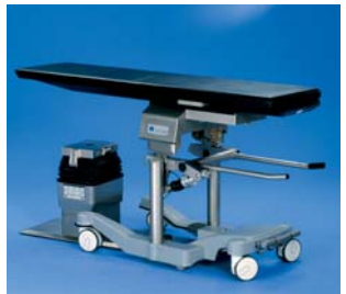
Shuttle can be docked on either side

The modular JUPITER interchangeable table tops fulfil all the requirements of modern diagnostic and operative medicine. Its equipment, functionality and extensibility make it the superior operating room table.