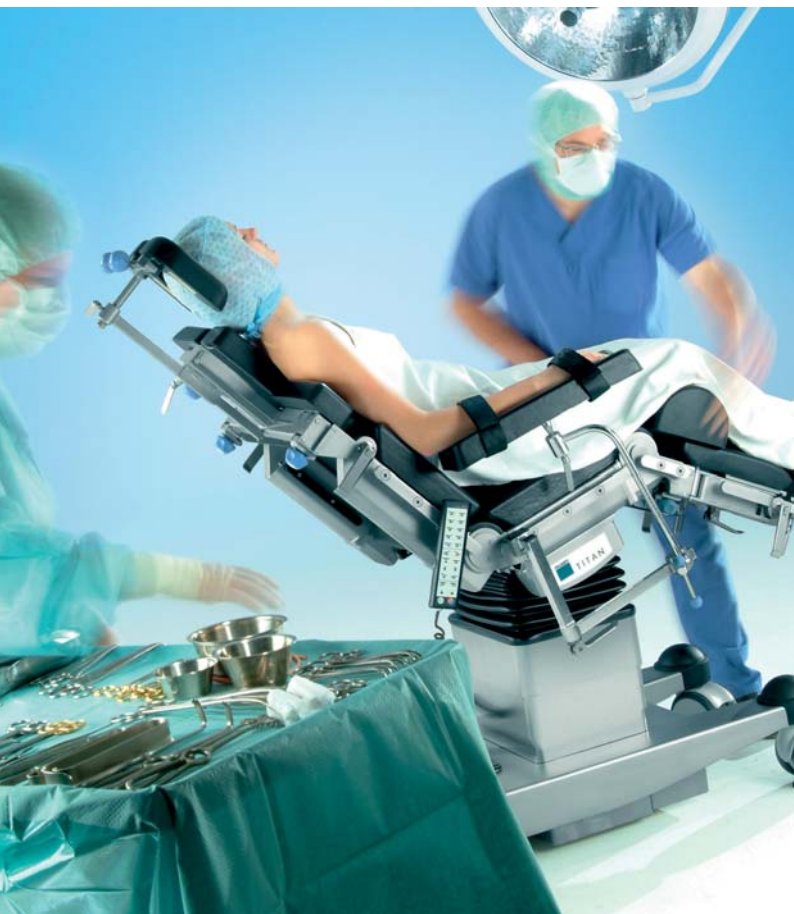
TITAN – the heavy weight carrying capacity table with drive

Fast and accurate positioning before and during operations