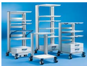
kombiTROLL® equipment trolleys