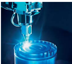
TRUMPF laser technology