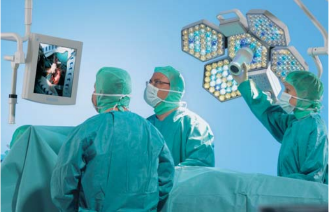
Digital image transfer and archiving during operations

The first sterile surgical light camera for use in operating rooms. With SDI output and digital image capture, it enables live transmission from the OR in digital video quality and fast, direct archiving of still images.