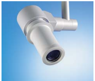
Camera on separate bracket

The first sterile surgical light camera for use in operating rooms. With SDI output and digital image capture, it enables live transmission from the OR in digital video quality and fast, direct archiving of still images.