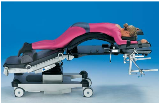
MARS low version – for spinal surgery, for example