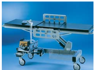
CALYPSO – radioscopic casting table and emergency transporter