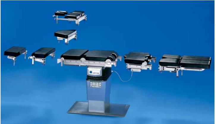
TRUMPF operating tables can be individually configured