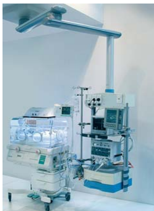
uniPORT in neo-natal care

Ergonomic and future-orientated for intensive use in clinics and practice.