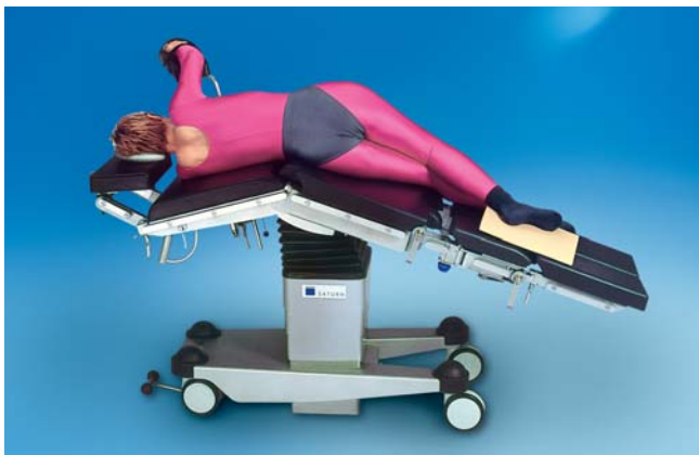
SATURN Select – renal position