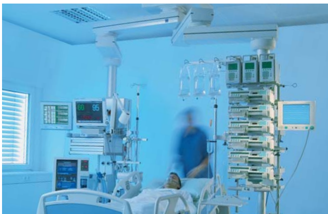
Intensive care – Freely-accessible head element facilitates emergency care