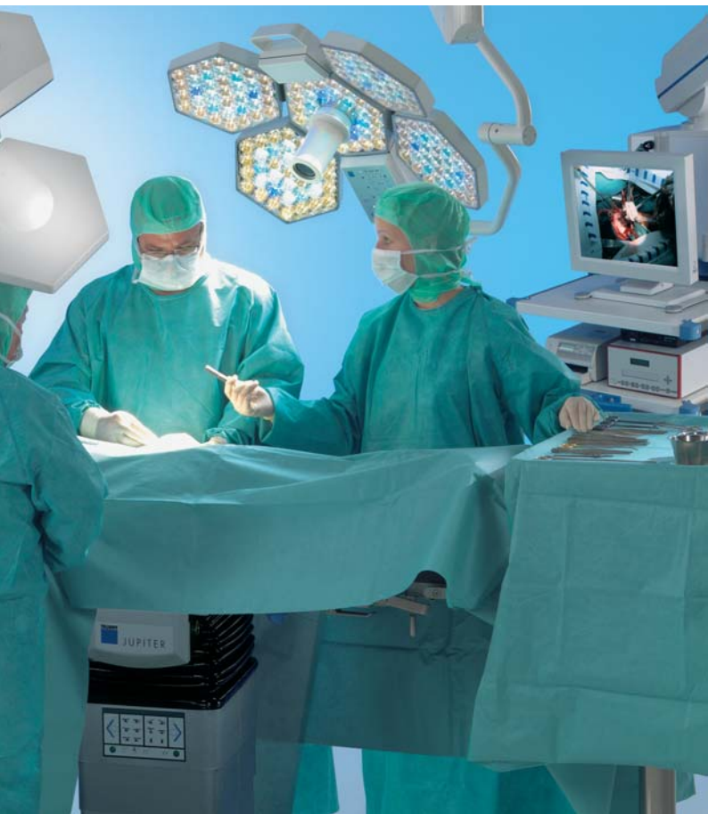
JUPITER – the adaptable and interchangeable system

Flexible and time-saving process flow in the operating room