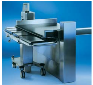
ORBITER – hassle-free, energy-saving patient transfer