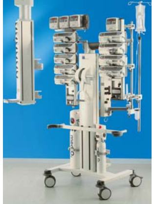
IMEC – safe and efficient transport for patients and personnel

Optimising processes is often the best way of leveraging cost-saving potential in hospitals. TRUMPF patient transport systems are a product family for intra-clinic patient transfer and facilitate intra-operative diagnostics. They optimise handling processes, make the work of hospital personnel easier and enhance patient safety.