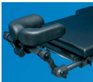
Carbon-fibre head positioning system

Intra-operative diagnostics are a key element of successful and cost-effective operating. Modular carbon-fibre operating tables and elements from TRUMPF are designed for all kinds of operations and enable hassle-free imaging at the exact point that the surgeon requires it.