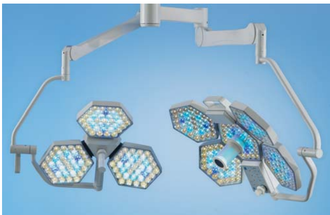
iLED 5 with camera / iLED 3