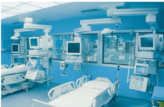
Intensive care / recovery area