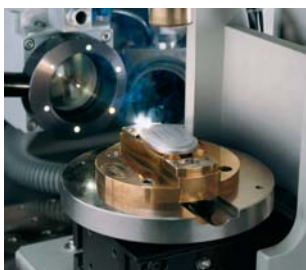
Lettering of cardiac pacemakers